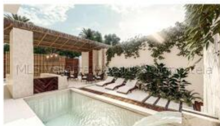
RENDERS / RENDER 13 TERRAZA