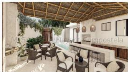
RENDERS / RENDER 14 TERRAZA