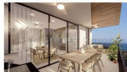
RENDERS / RENDER 12 TERRAZA PRINCIPAL