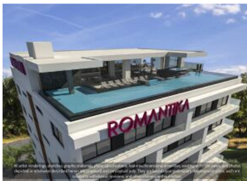
All artist renderings, sketches, graphic materials, plans, specifications, features, dimensions, amenities, existing or future views, and photos depicted or otherwise described herein are proposed and conceptual only. They are based upon preliminary development plans, which are subject to withdrawal, revisions, and other changes without notice.