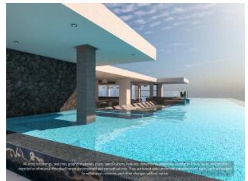
All artist renderings, sketches, graphic materials, plans, specifications, features, dimensions, amenities, existing or future views, and photos depicted or otherwise described herein are proposed and conceptual only. They are based upon preliminary development plans, which are subject to withdrawal, revisions, and other changes without notice.