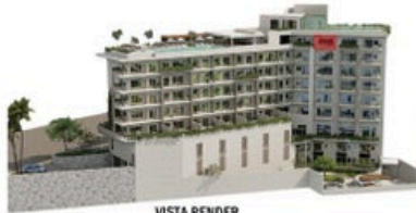
VISTA RENDER MI S Vallarta Nayarit Compostela